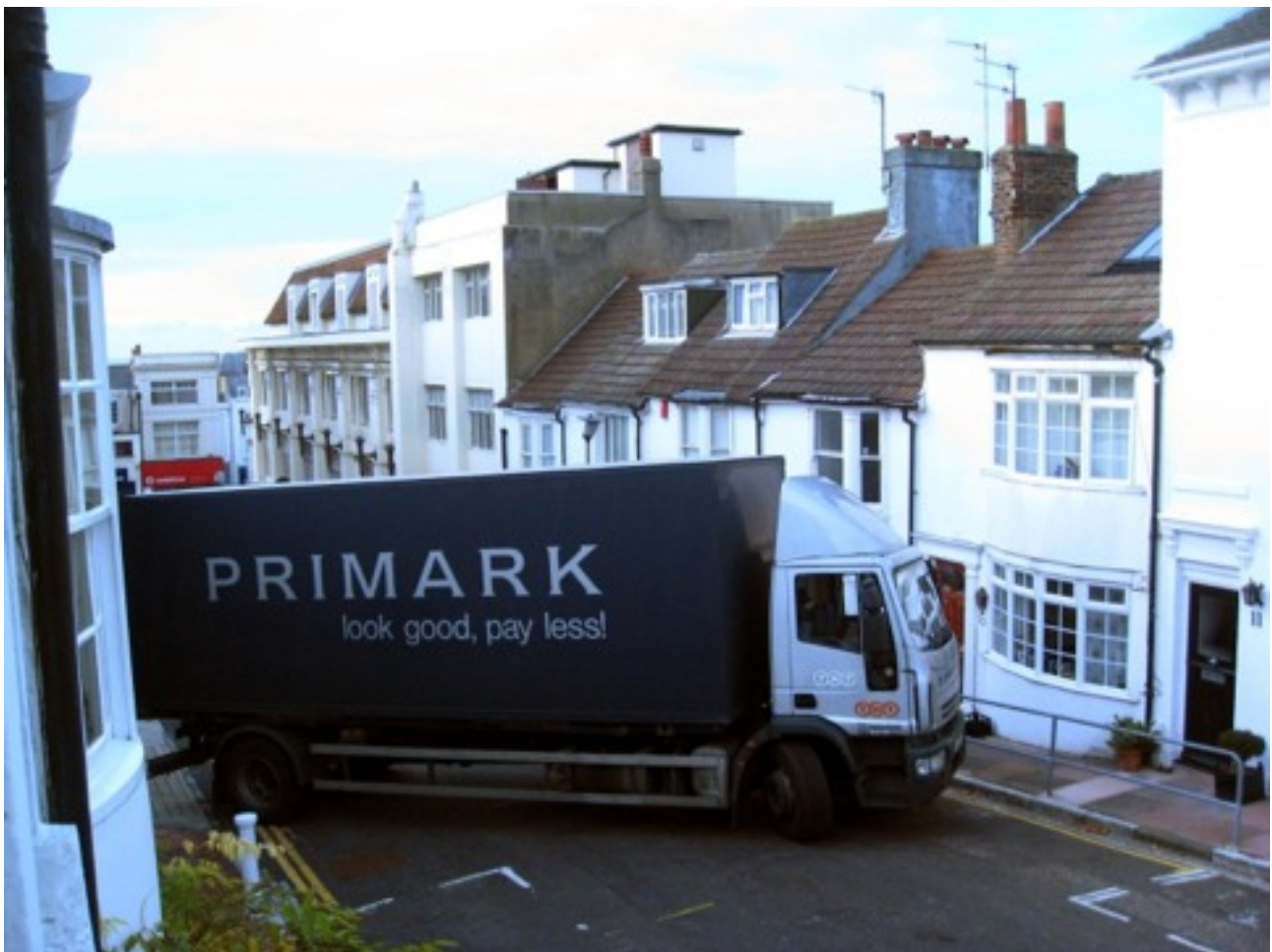
A vehicle being unloaded in Crown Street. Note it is not reversed into the yard hence blocking access to most of the street.

Since Primark have moved into the former Littlewoods store they have caused considerable noise and disturbance to their neighbours. The key source of this is that deliveries and servicing (such as refuse collection) are done through the cul-de-sacs of Crown Street and Marlborough Street.